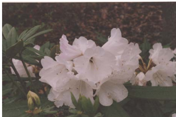
R. metternichii × R. hyperythrum .

Now for a followup on the cuttings I made last fall. I stuck 27 cuttings and 20 have good roots, and the foliage looks good. Two have roots but their foliage looks terrible so I’ll wait to see if they sprout new growth. Five have no roots but the foliage looks good on 4 cuttings so I will leave them in their plastic bags and give them a bit more time. The last one I threw out. Three of the cuttings that rooted well are