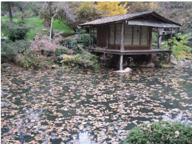
Junco Liesfeld's garden.