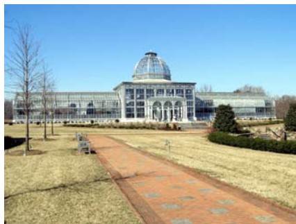
The new conservatory at Lewis Ginter Botanical Garden.

garden with “tapestry steps” made by using a variety of materials that they had on hand. They also had no master plan and owe their success to their combined talents which include Pat’s knowledge of plants and Hugh’s design and building skills. At the Lewis Ginter Botanical Garden we will be served a tasty box lunch in a special tent reserved just for our group. There will be plenty of time to explore the forty-some acres of spectacular gardens and check out the “Walk on the Wild Side” where