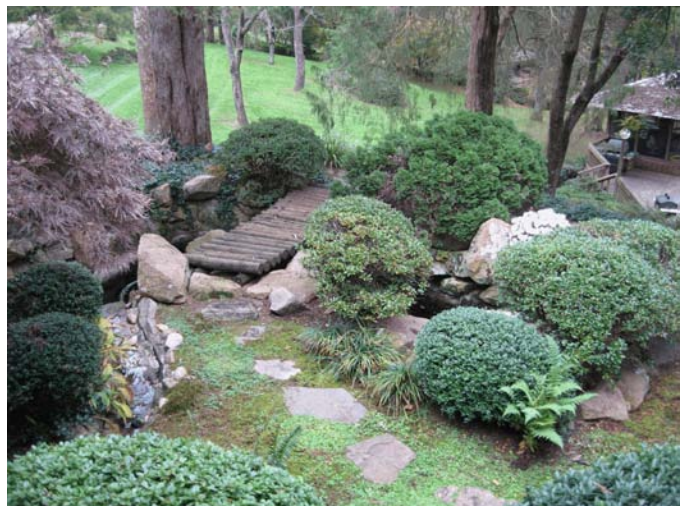
Junco Liesfeld's garden.