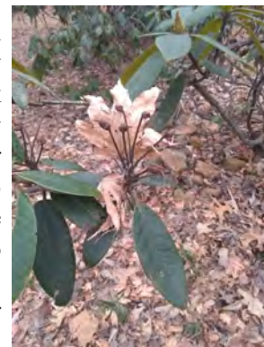
Dead Japanese maple leaf with Rhododendron seed capsules.

a rhodo made a nice mini-sculpture. We still enjoy the Autumn ferns although they are looking a bit beat up. We do not enjoy seeing the evergreen honeysuckle that is now very obvious in the bank of azaleas by the driveway as well as in some other azaleas and rhodos. Ditto for the green briar. There was a pause in the walk to pull out the honeysuckle. Green briar is saved for another day. The two inch squares of dwarf Mondo grass by the brick walkway are looking good.