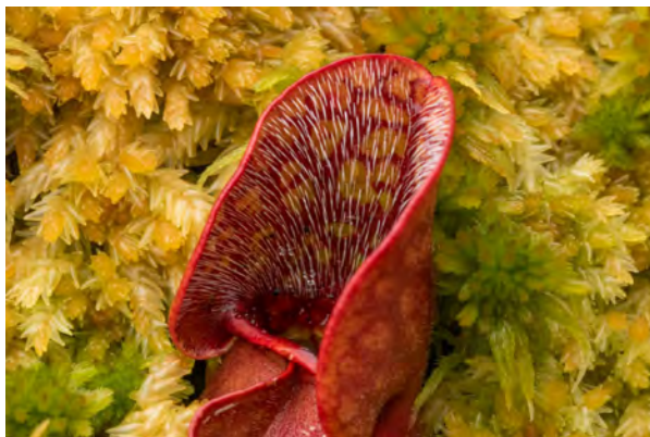
Sarracenia purpurea Pitcher Plant.

Aplectrum hyemale (hyemale referring to the prominent evergreen leaf which lasts through winter) naturally grows in our immediate area and hopefully this plant will bloom in late May. The leaf disappears through the warm months. Its corm can be smashed, and it will release a very gelatinous and sticky substance.