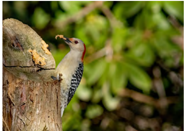
Red bellied woodpecker and R. ‘Catawbiense Album’ .

Our few cranberry plants are finally becoming more robust in the bog gardens. Maybe they will soon begin producing a berry or two. The age-old question of what to do with excess seedlings is familiar to many ARS members. Well, this fall in