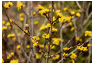
Cornus Officinalis .

20 degrees. The garden is already blooming. Hellebores are moving past the bud stage and beginning to blossom. Our 'Magic Fire' witch-hazel has been in full bloom since late January and a dozen more varieties are "waking up" as well. Cornus officinalis , the Japanese Cornelian Dogwood is in full bloom and its myriad of bright yellow flowers complements the reds,