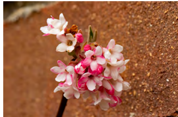
Viburnum bodnantense .

20 degrees. The garden is already blooming. Hellebores are moving past the bud stage and beginning to blossom. Our 'Magic Fire' witch-hazel has been in full bloom since late January and a dozen more varieties are "waking up" as well. Cornus officinalis , the Japanese Cornelian Dogwood is in full bloom and its myriad of bright yellow flowers complements the reds,