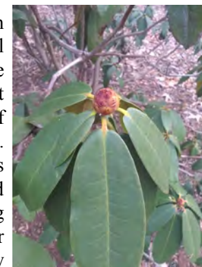
Promising bud with reddish scales.

The large flower buds on some six foot tall deciduous azaleas are looking quite nice. That should be a good bloom if the weather cooperates. Also, the red flower buds on a large rhodo contrasted nicely with its drooping green leaves. On another day with low fog, we saw some of the azaleas frosted because of the hairs on their stems and leaves.