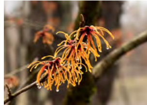
Witchhazel 'Magic Fire'.