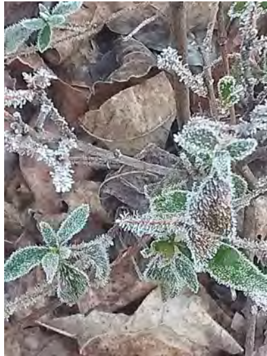
Frosted leaf hairs and stems on azaleas.