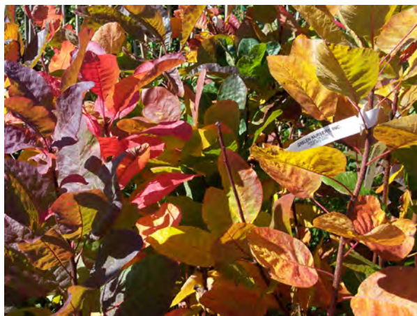
Colorful fall foliage on young Smoke Trees.