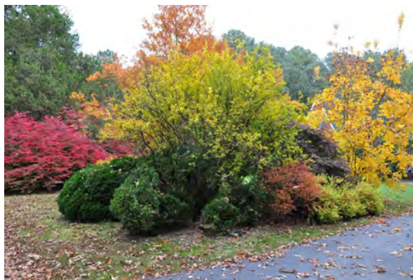
Bill Bedwell's colorful foliage: left to right Euonymus alatus , 'Compactus', Pomegranate shrub in center with Crepe myrtle 'Miami' behind it. Barberry 'Rose Glow' is in front. Boxwoods are the dark green.

I have a large crepe myrtle 'Natchez' not far from the Euonymus and it usually has yellow foliage in the fall. In last autumn the foliage was frozen just as it began to change colors and now remains brown and clinging on. Had the foliage not frozen, I think it too would have dropped its yellow leaves before the Euonymus turned into the burning bush that it was on November 24, 2019.