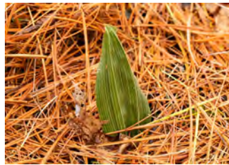
Puttyroot Orchid.

We have found a new resident in our garden plantings. This fall the leaf of the native Puttyroot Orchid appeared in the pine needle mulch.