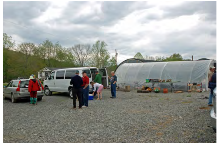
Visiting North Hills Nursery, Specialty Succulents.