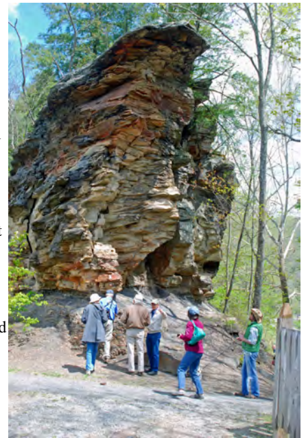
Rocks at Falls Mill Picnic Area of the Burnsville Dam Project where we had our picnic lunch. The ancient Pennsylvanian Period rocks had fossils in them.