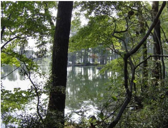
Norfolk Botanical Garden.