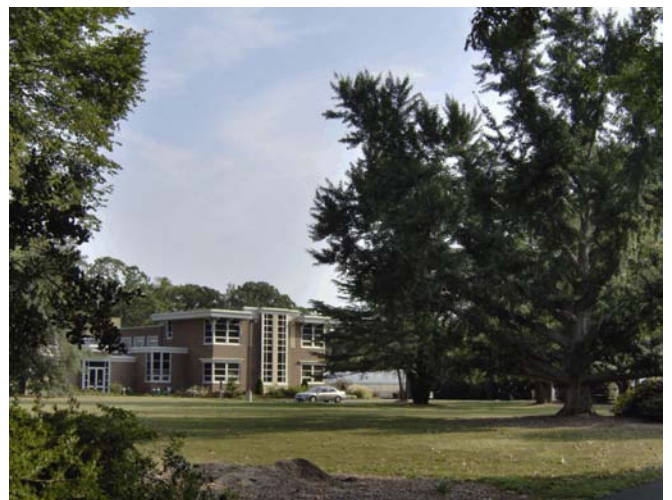
New building at Hampton Roads Agricultural Research and Extension Center.