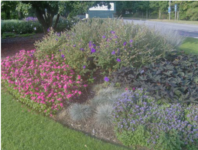
Planting at Norfolk Botanical Garden.