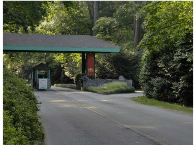
Norfolk Botanical Garden entrance.