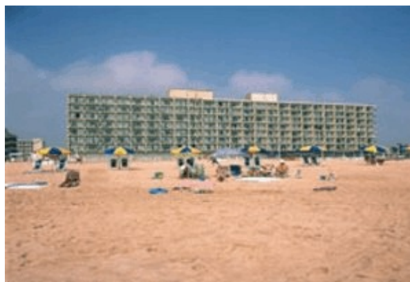
Ramada on the Beach in Virginia Beach.