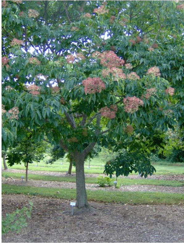
Evodia daniellii at Hampton Roads Research and Extension Center.

enjoy a peek at the show of fall blooming camellias.)