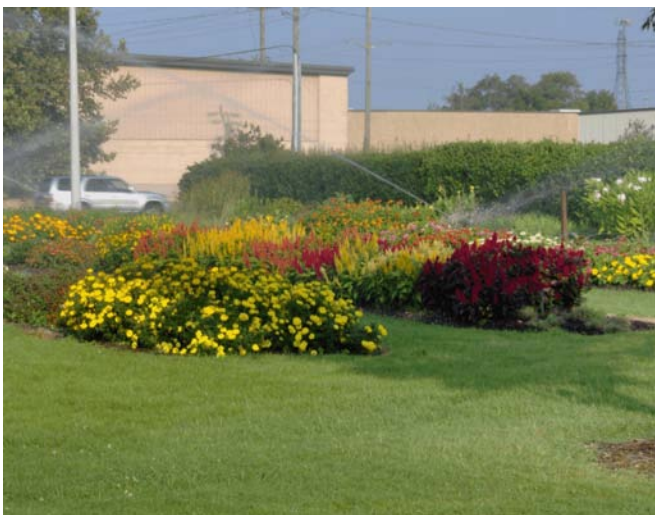
Colorful display at Hampton Roads Agricultural Research and Extension Center.