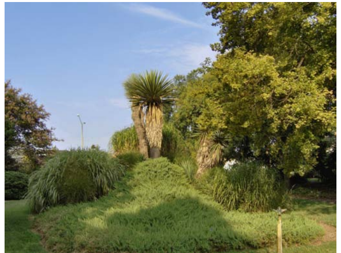
Arboretum at Hampton Roads Agricultural Research and Extension Center.