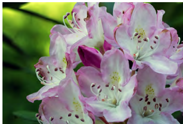
'Red Max' seedling.

Speaking of falling rain, our entire summer has been rainy here in central West Virginia. Despite this or because of this, our rhodos, azaleas and most everything in the garden has bloomed and grown terrifically. A 'Red Max' seedling from a chapter meeting is now 3 feet tall and 5 or so feet wide. The buds are dark pink and the open flowers retain dark pink margins. Add a green blotch to the upper petal