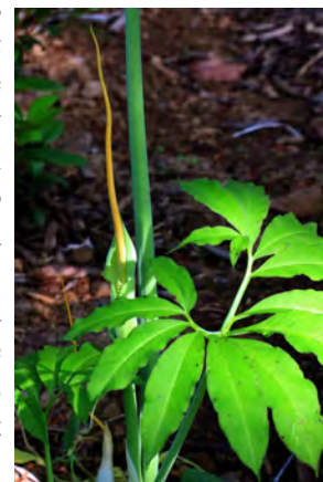
Green Dragon.

Plumleaf Azaleas. The hummingbirds love to visit these plants. One “weed” that we have throughout our landscape beds is Cardinal Flower ( Lobelia cardinalis ). These native lobelias self-sow profusely. Plants can grow, are given away to garden groups and pulled and discarded. Butterflies, hummingbirds and various other insects make for interesting walks through the garden. Great Blue Lobelia ( L. siphilitica ) and Downy Lobelia ( L. puberula ) also are nice companion plants and bloom through the summer months.