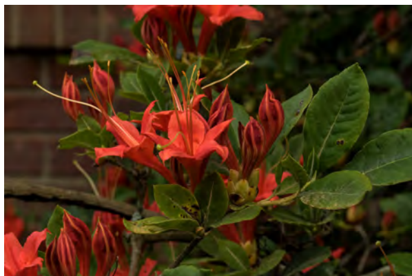
R. prunifolium .