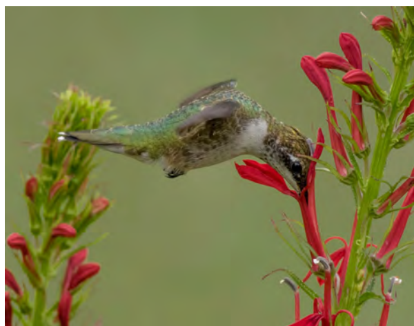
Hummingbird on Lobelia cardinalis .

Plumleaf Azaleas. The hummingbirds love to visit these plants. One “weed” that we have throughout our landscape beds is Cardinal Flower ( Lobelia cardinalis ). These native lobelias self-sow profusely. Plants can grow, are given away to garden groups and pulled and discarded. Butterflies, hummingbirds and various other insects make for interesting walks through the garden. Great Blue Lobelia ( L. siphilitica ) and Downy Lobelia ( L. puberula ) also are nice companion plants and bloom through the summer months.