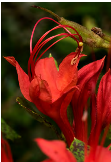
Closeup of R. prunifolium .

By mid-July our Plumleaf Azaleas ( R. prunifolium ) reached its full display. The season for this plant seems to be creeping from late July toward the middle of the month now. A nice salmon colored hybrid from the ARS seed exchange also was a nice companion to the scarlet of the