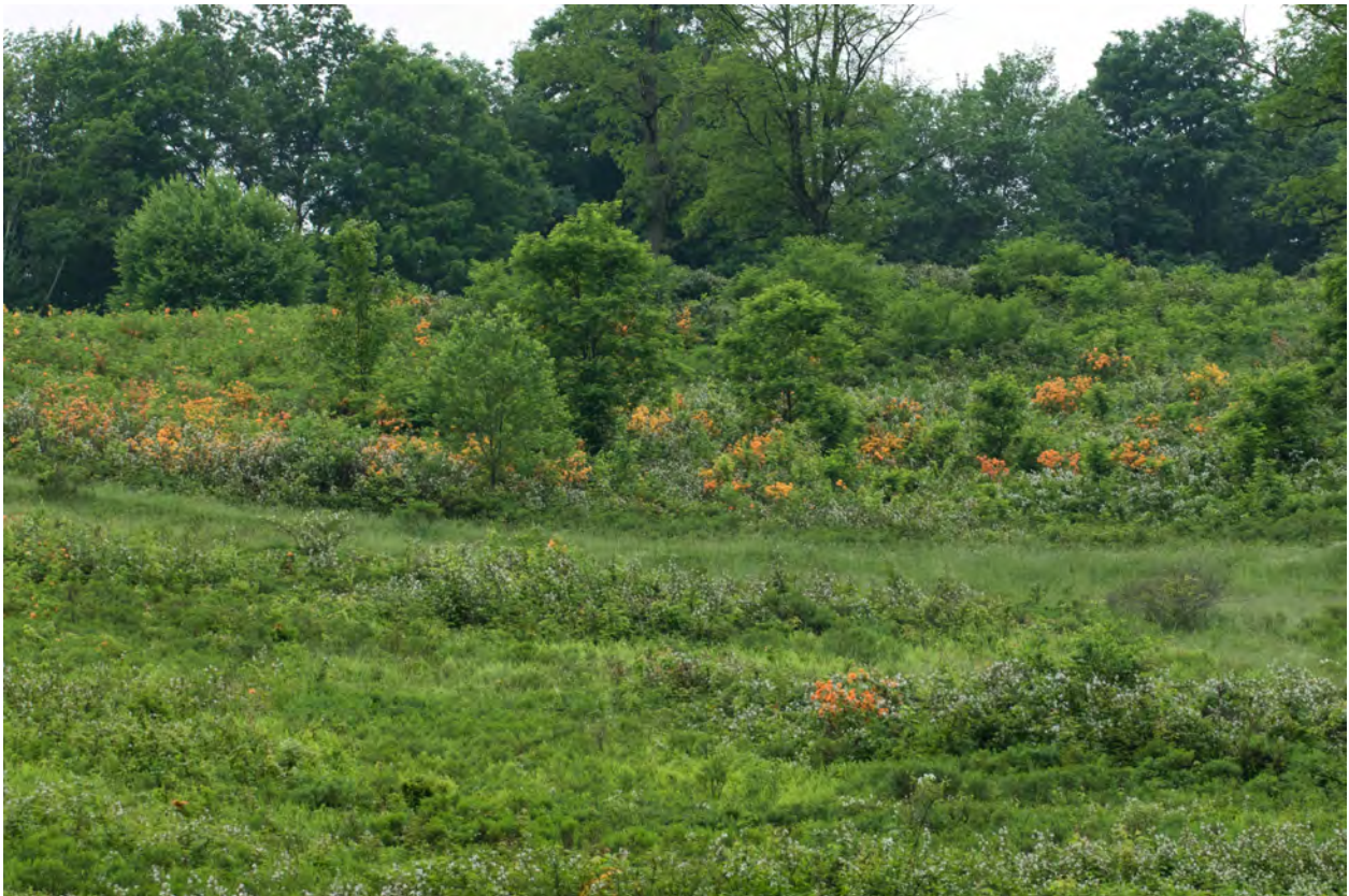
June 2, 2018, Flame Azalea hillside.

http://triblive.com/lifestyles/homegarden/13673818-74/retired-dentist-takes-great-pride-in-his-20-acre-woodland-garden