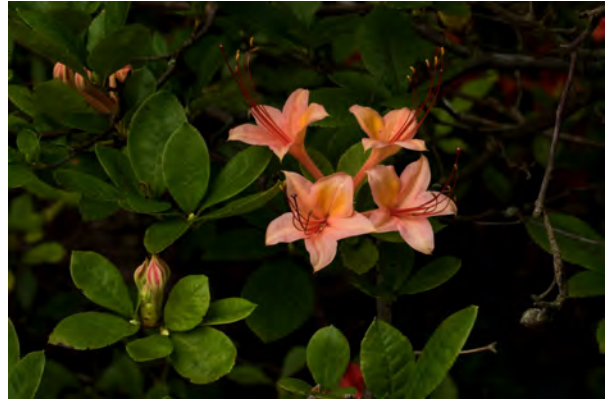
July 15, 2018, ARS Seed Excjamge seedling.

Remember all photos can be seen in color and ENLARGED at MACARS.ORG. Click on Newsletter on left panel.